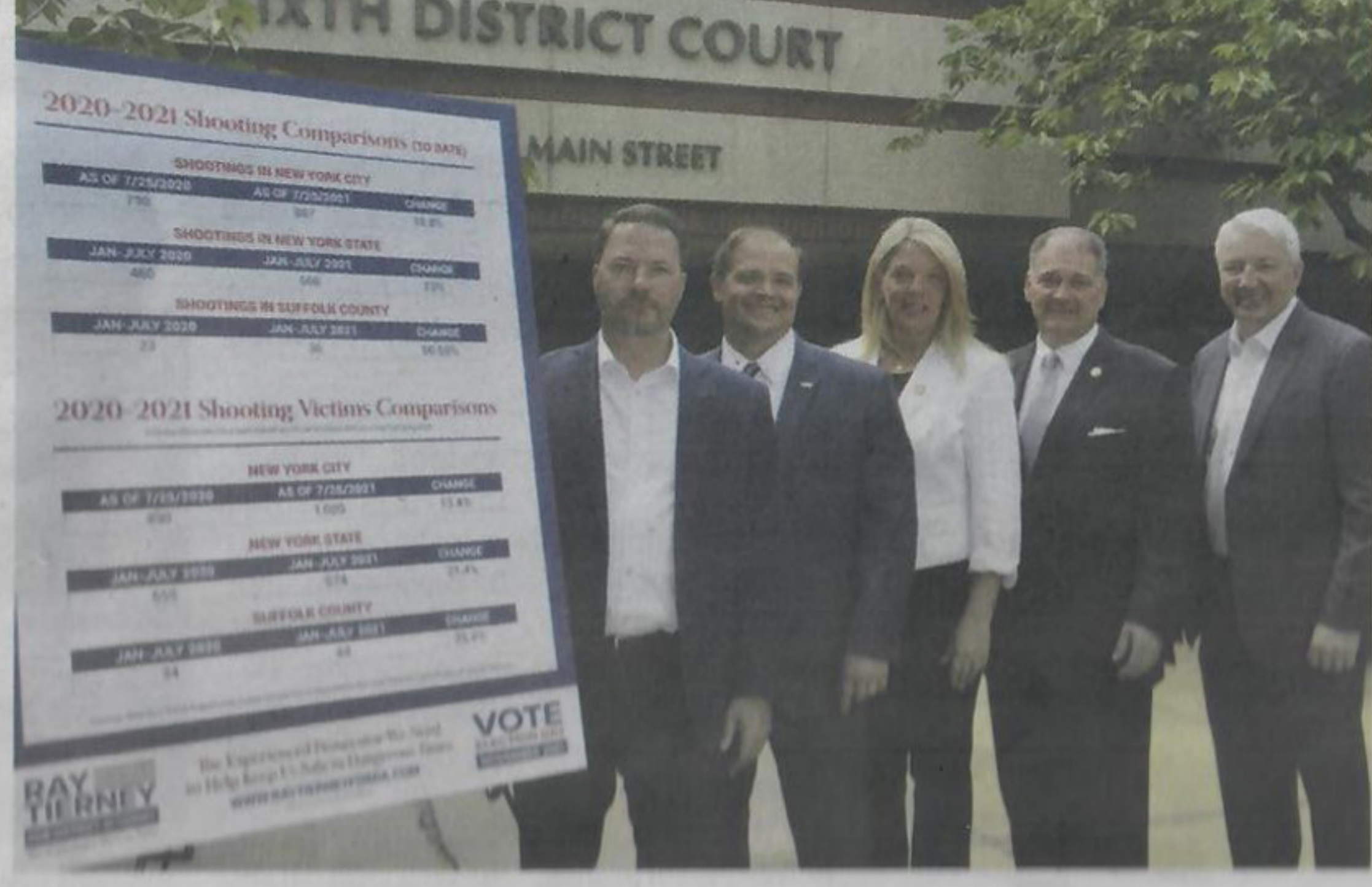
Tierney and the Senators outside of the Sixth District Court building.

An overall pro-criminal, anti-police climate fostered under all-Democrat rule.